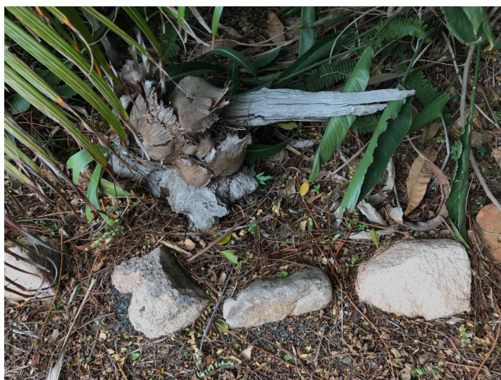
Shows the stump in the front garden with active termites in it.