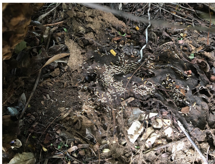
Shows an example of the active termites in/under the stump in the front garden.